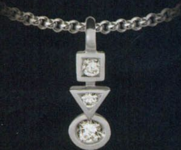
Pendentif Alchimie A partir de 2150 €