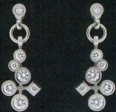
Boucles d'oreilles Cascade A partir de 6500 €

PARIS - MONTBRISON - LYON Place Vendôme - 8 Rue Tupinerie - 105 Rue Rue de Rennes - Edouard Herriot 40 20 00 19 - 04 77 96 08 84 - 04 78 92 95 94 www.philippetournaire.com