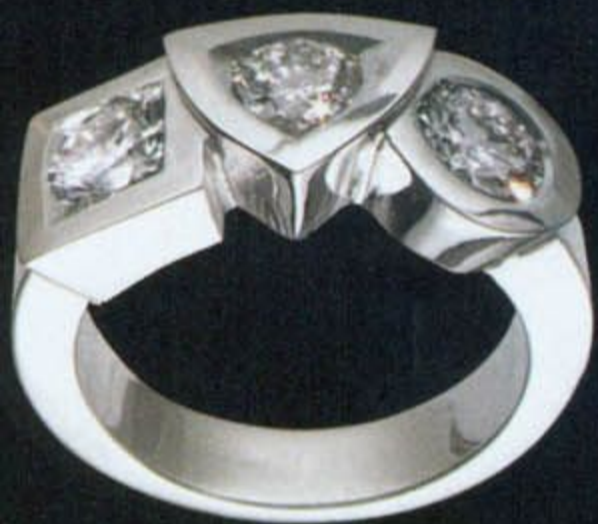
Trilogie Alchimie A partir de 2500 €