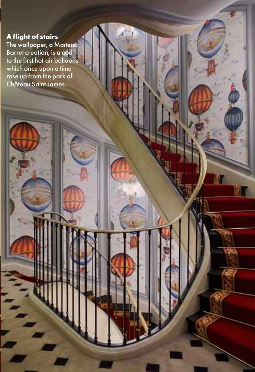
A flight of stairs The wallpaper, a Maitena Barret creation, is a nod to the first hot-air balloons which once upon a time rose up from the park of Château Saint James.