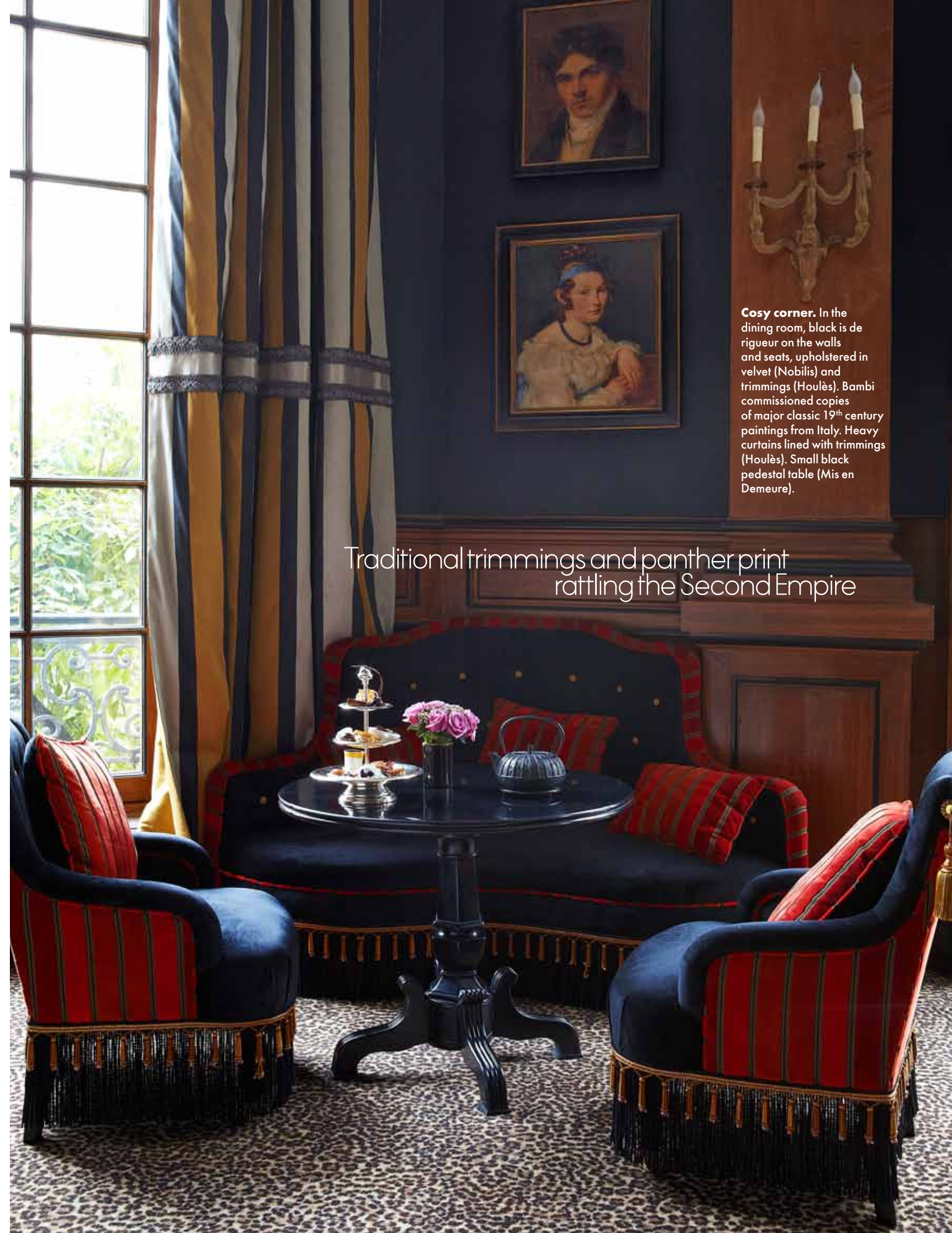
Cosy corner. In the dining room, black is de rigueur on the walls and seats, upholstered in velvet (Nobilis) and trimmings (Houlès). Bambi commissioned copies of major classic 19 th century paintings from Italy. Heavy curtains lined with trimmings (Houlès). Small black pedestal table (Mis en Demeure).

Traditional trimmings and panther print rattling the Second Empire