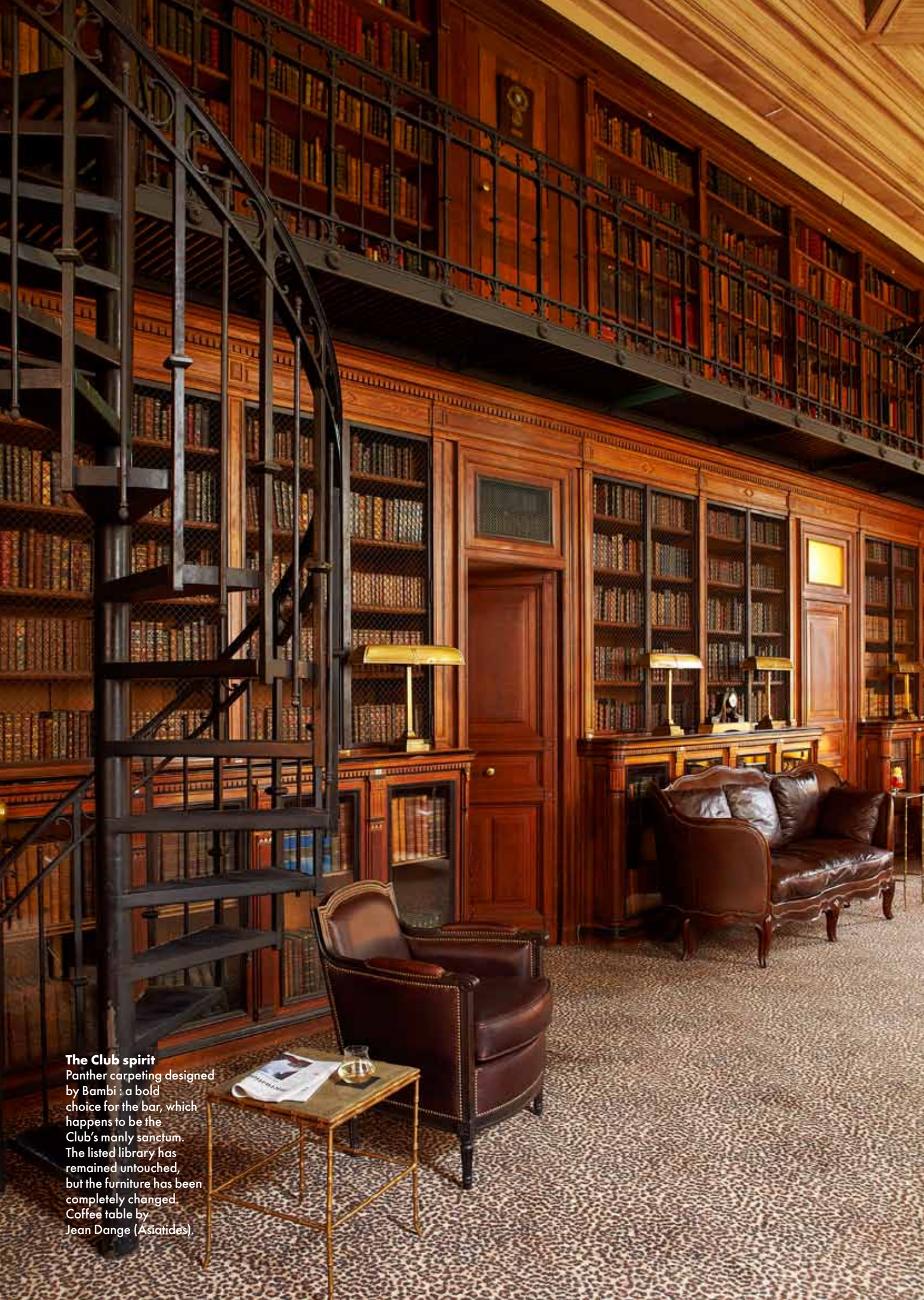
The Club spirit Panther carpeting designed by Bambi : a bold choice for the bar, which happens to be the Club's manly sanctum. The listed library has remained untouched, but the furniture has been completely changed. Coffee table by Jean Dange (Astatides).