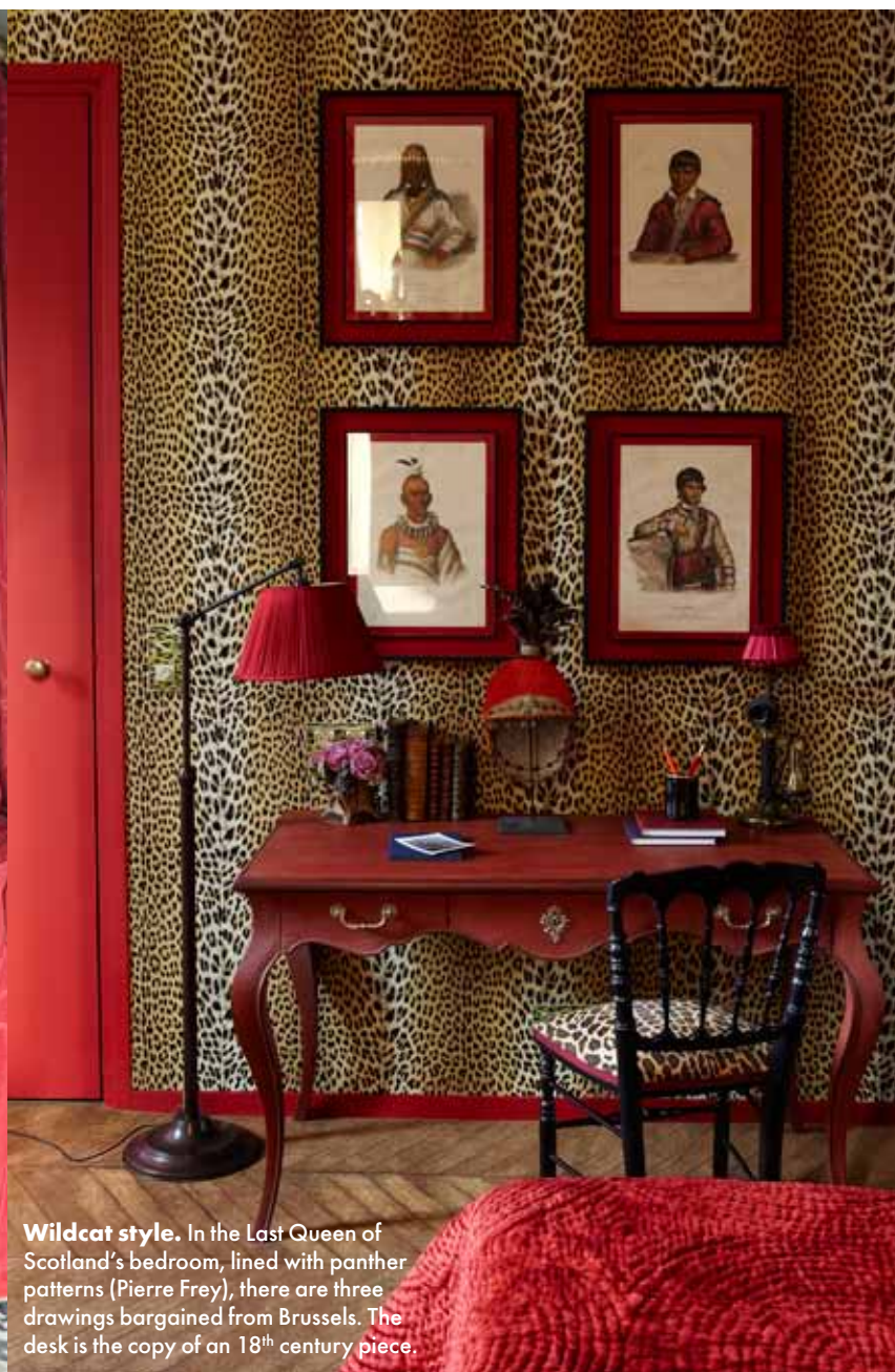
Wildcat style. In the Last Queen of Scotland's bedroom, lined with panther patterns (Pierre Frey), there are three drawings bargained from Brussels. The desk is the copy of an 18 th century piece.

herringbone parquet and Burgundy stone. So, as a solution, she picked up a pen and designed carpeting that looks every bit like it. She has even been bold enough to put panther carpeting in the 'great library'. «Yet the result is sober. And why is that? Because a panther print always works when it contains at least five colours.» Well, there are colours everywhere, yet it begins with black and white like on the elegant balusters in the lobby's great staircase. «At first, I had coloured everything in watercolours, and then one night, I remembered that scene in «My Fair Lady» where all the women wearing Cecil Beaton creations could be seen at the Ascot Races in their white dresses, waists accentuated by black belts. And suddenly, I saw the great staircase in the lobby painted in black and white.»