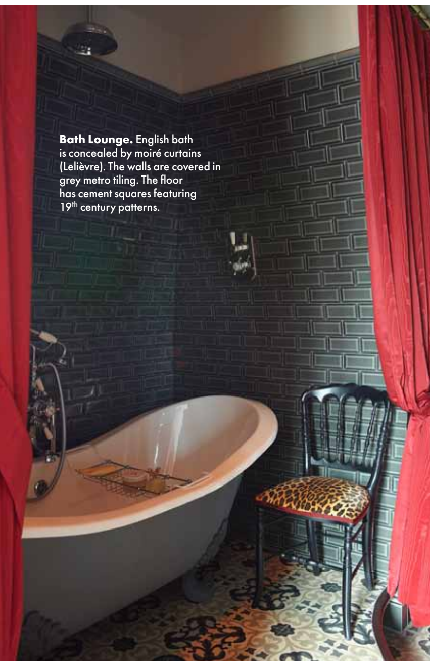
Bath Lounge. English bath is concealed by moiré curtains (Lelièvre). The walls are covered in grey metro tiling. The floor has cement squares featuring 19 th century patterns.